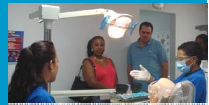
Students explaining dental procedures.