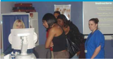
Our guests are intrigued by the knowledge of our sonographers.